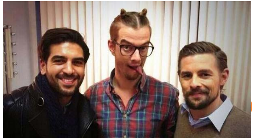
Actors – Elyas M'Barek, Joko and Claas