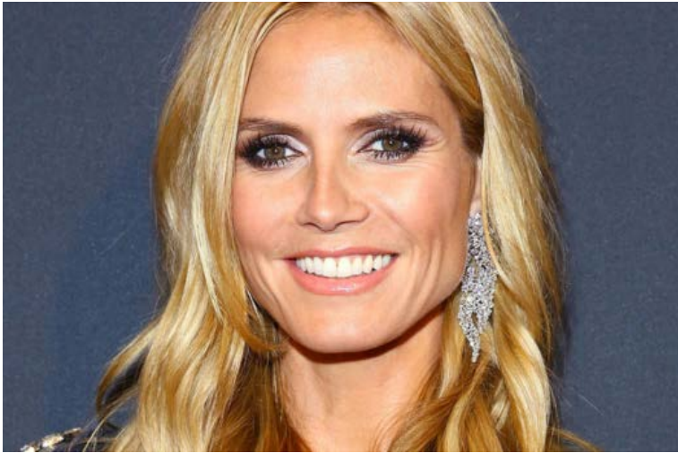
Model – Heidi Klum