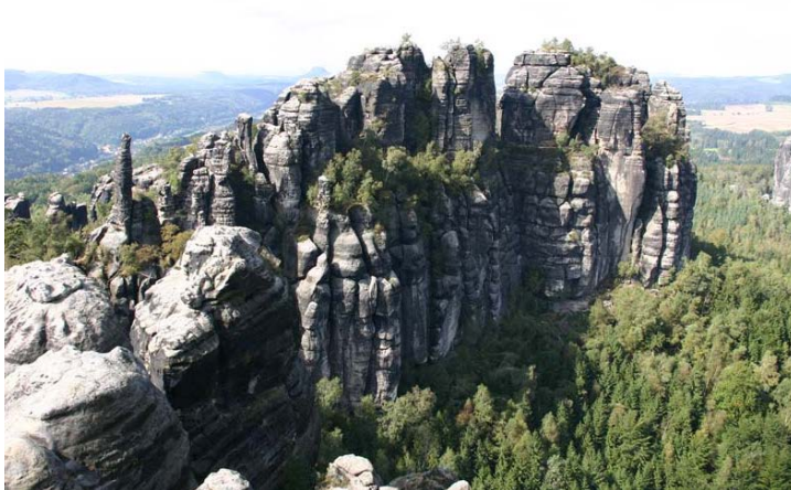
Elbsandsteingebirge – Near Dresden